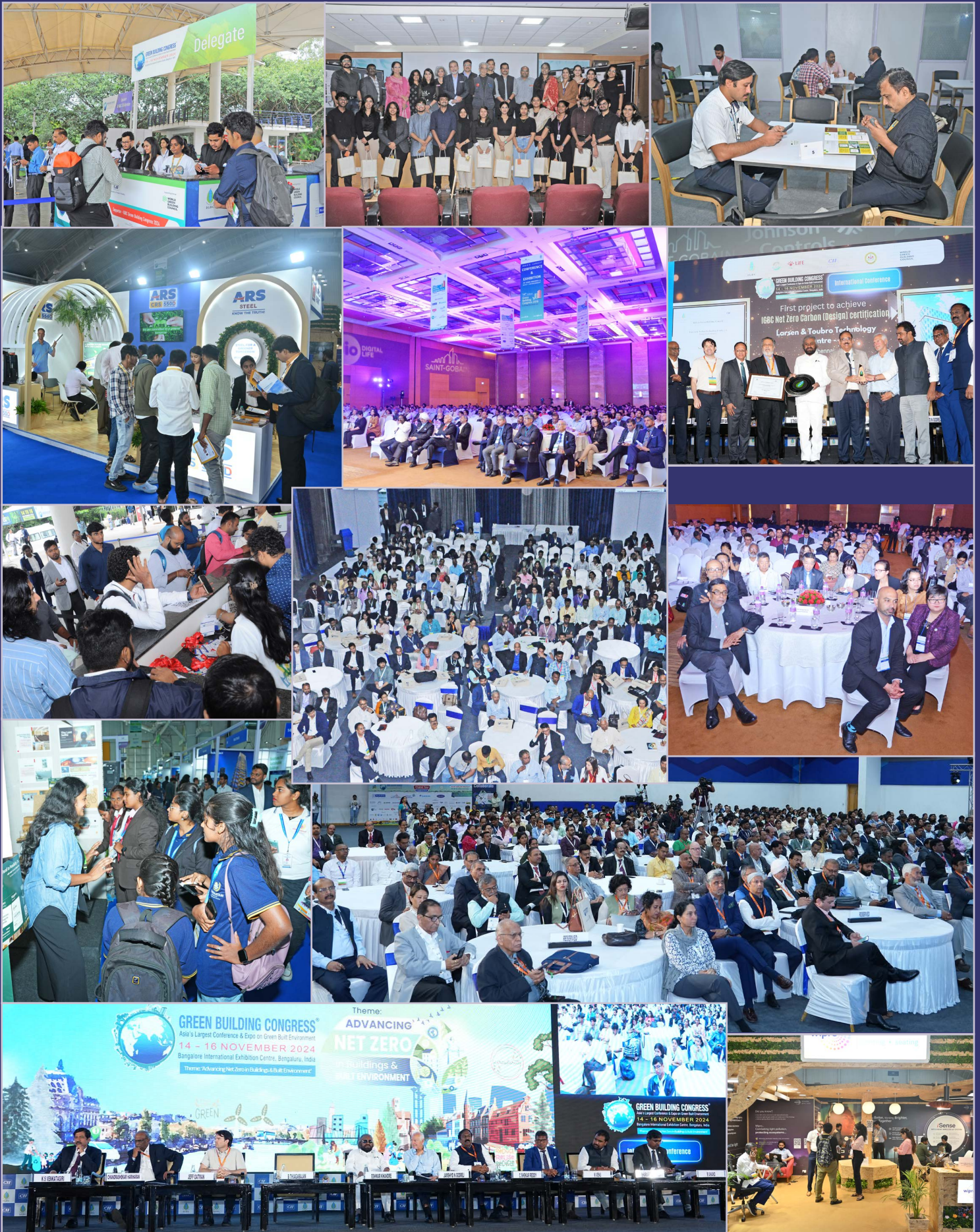
IGBC's Green Building Congress – Asia's Largest Conference & Expo on Green Built Environment