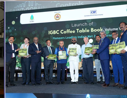
IGBC's Green Building Congress – Asia's Largest Conference & Expo on Green Built Environment